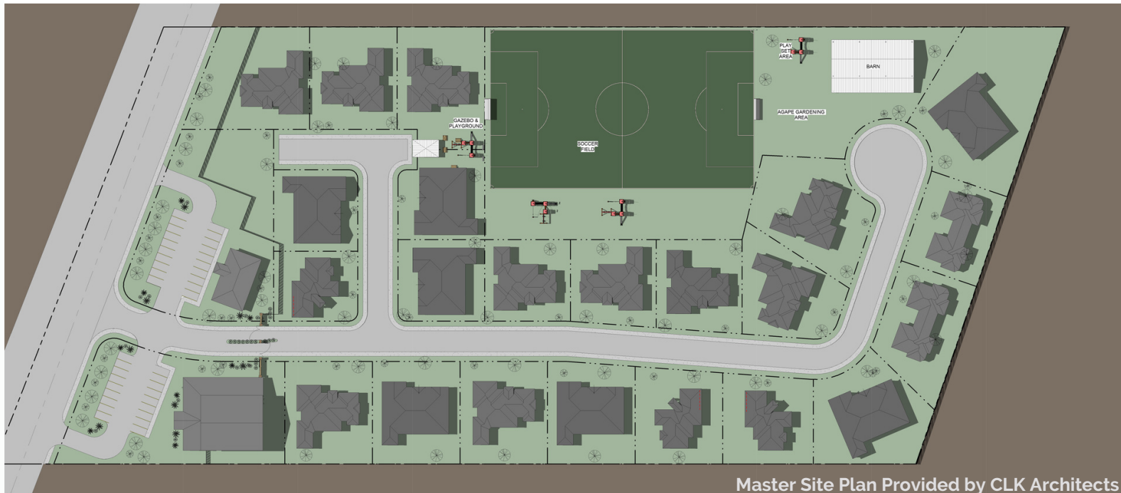
Master Site Plan